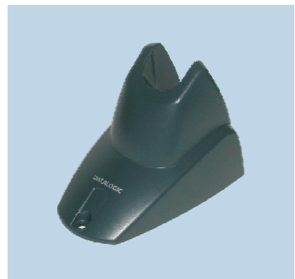
STD Heron™ Hands-free Stand with optional metal plate